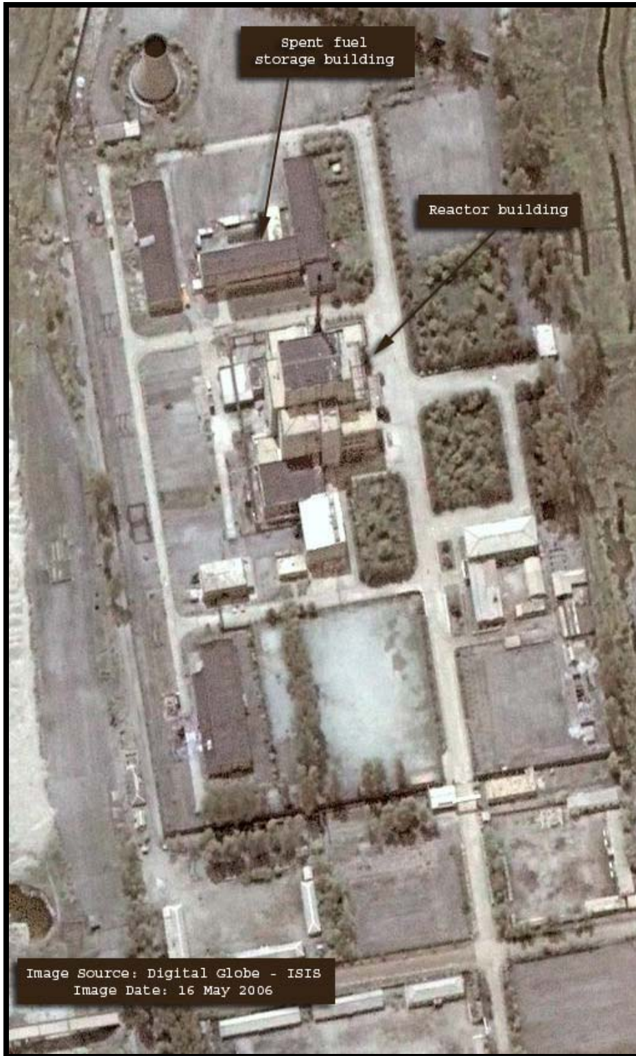
5 MWe reactor at Yongbyon.