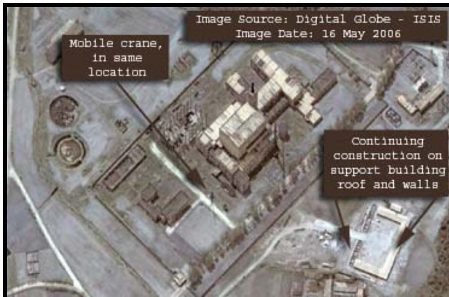
May 16, 2006

A comparison of September 2005 and May 2006 images of the 50 MWe reactor at Yongbyon. Continuing construction is evident at a support building adjacent to the 50 MWe reactor facility. Within the compound housing the industrial buildings, however, there does not appear to be any substantial construction activity. A mobile crane, first identified in the September 2005 image, remains in the same location in May 2006.