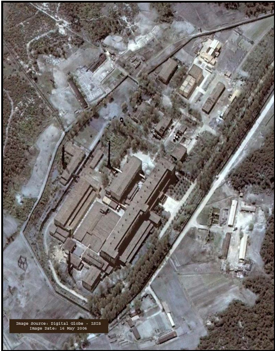
Radiochemical Laboratory at Yongbyon. Note the demolished corner near the bottom of the image in a facility whose purpose is unknown. The “canyon” where reprocessing occurs is a long, multistory building on the right