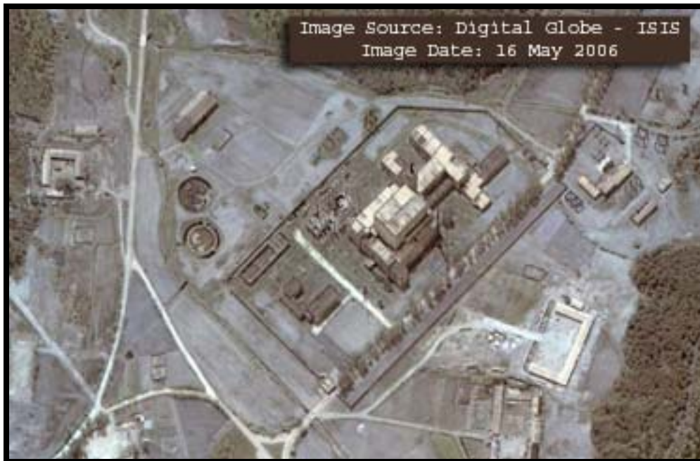
50 MWe reactor at Yongbyon.